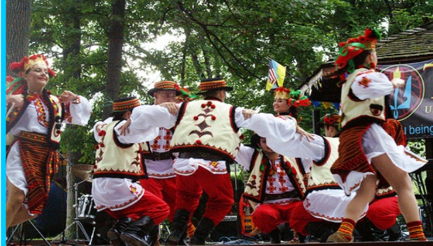
Voloshky Ukrainian Dance Ensemble (Philadelphia, PA)