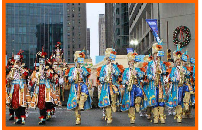
Fralinger Mummers String Band (Philadelphia, PA)

12:00 - 1:30 Music and Dancing - "KARPATY" ORCHESTRA