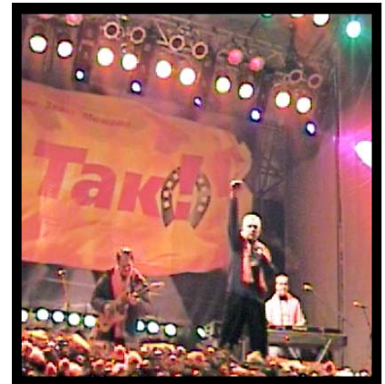
Fata Morgana Band